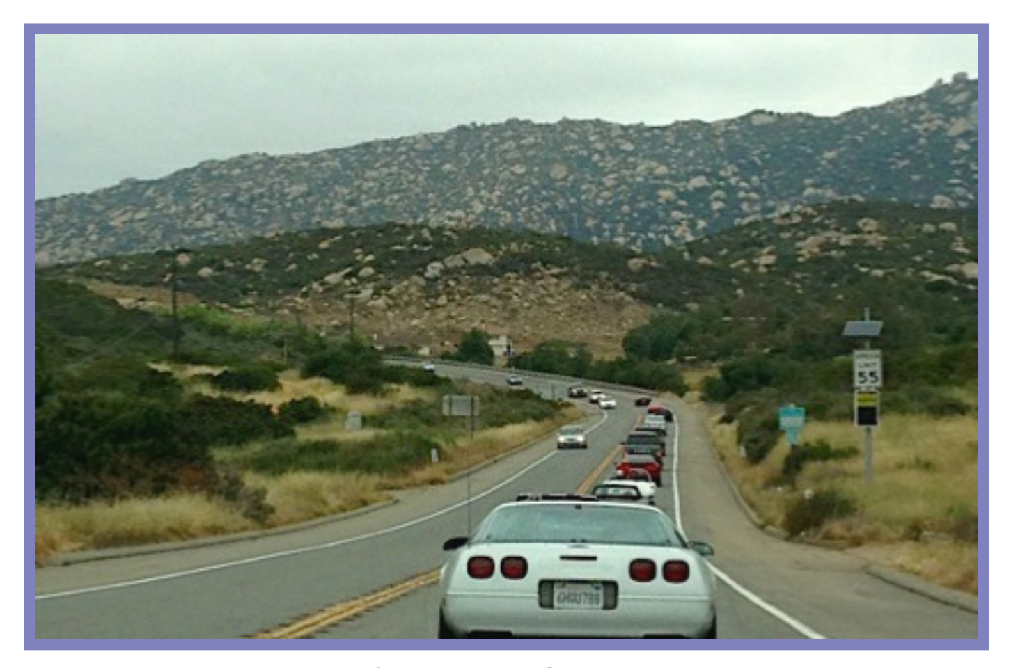
On the road to Ramona!