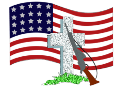
ALL GAVE SOME, SOME GAVE ALL