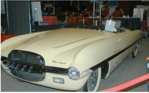
Two rare Dodge Firearrows each brought over a million dollars.