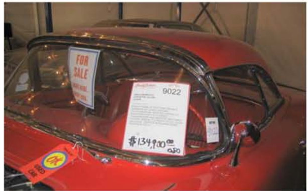
Take your pick of '62 fuelies. Do you want a red one for $135,000 or do you prefer fawn beige for ten thousand less?