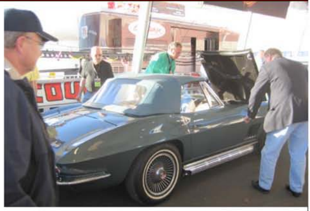
There were 149 Vettes auctioned at the show.