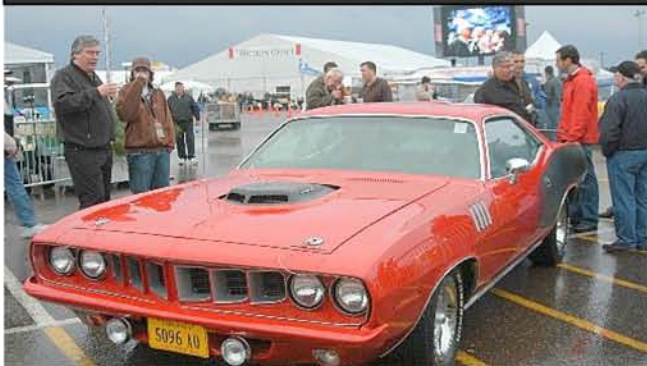
Many were shocked at the sale prices of the 70's era cars.