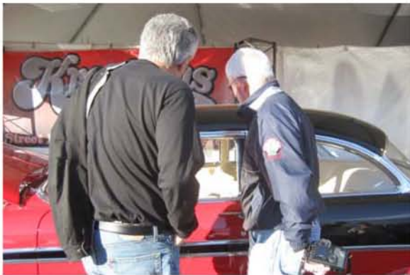
Lots of vendors to check before going out to see the drivers showing off their drifting skills.