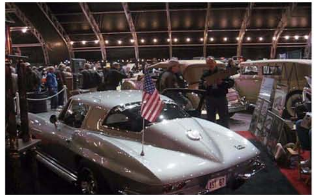
Along with the Last Sting Ray, Pro Team displayed the two red tankers together.