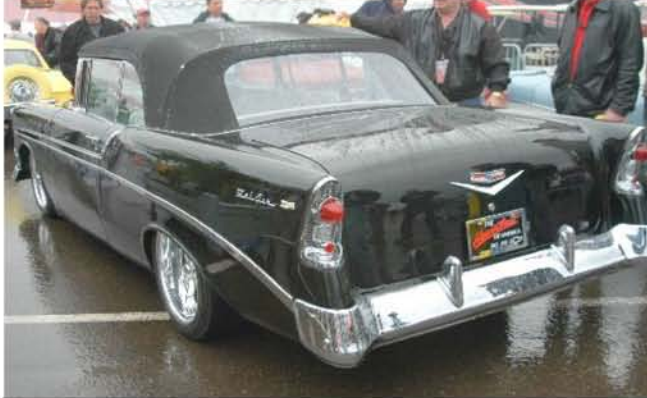
This is not the way you want to introduce your 57 classic.... covered with rain!