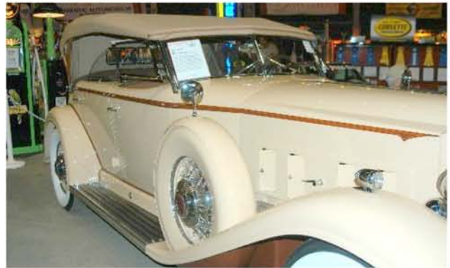
A Duesenberg impressed even those who couldn't afford to bid.