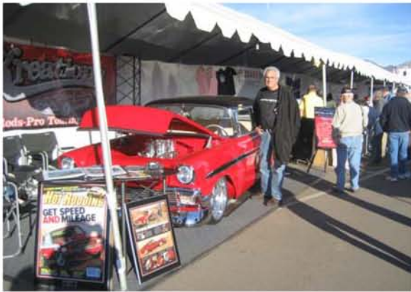
One day of sunshine before the rain began.