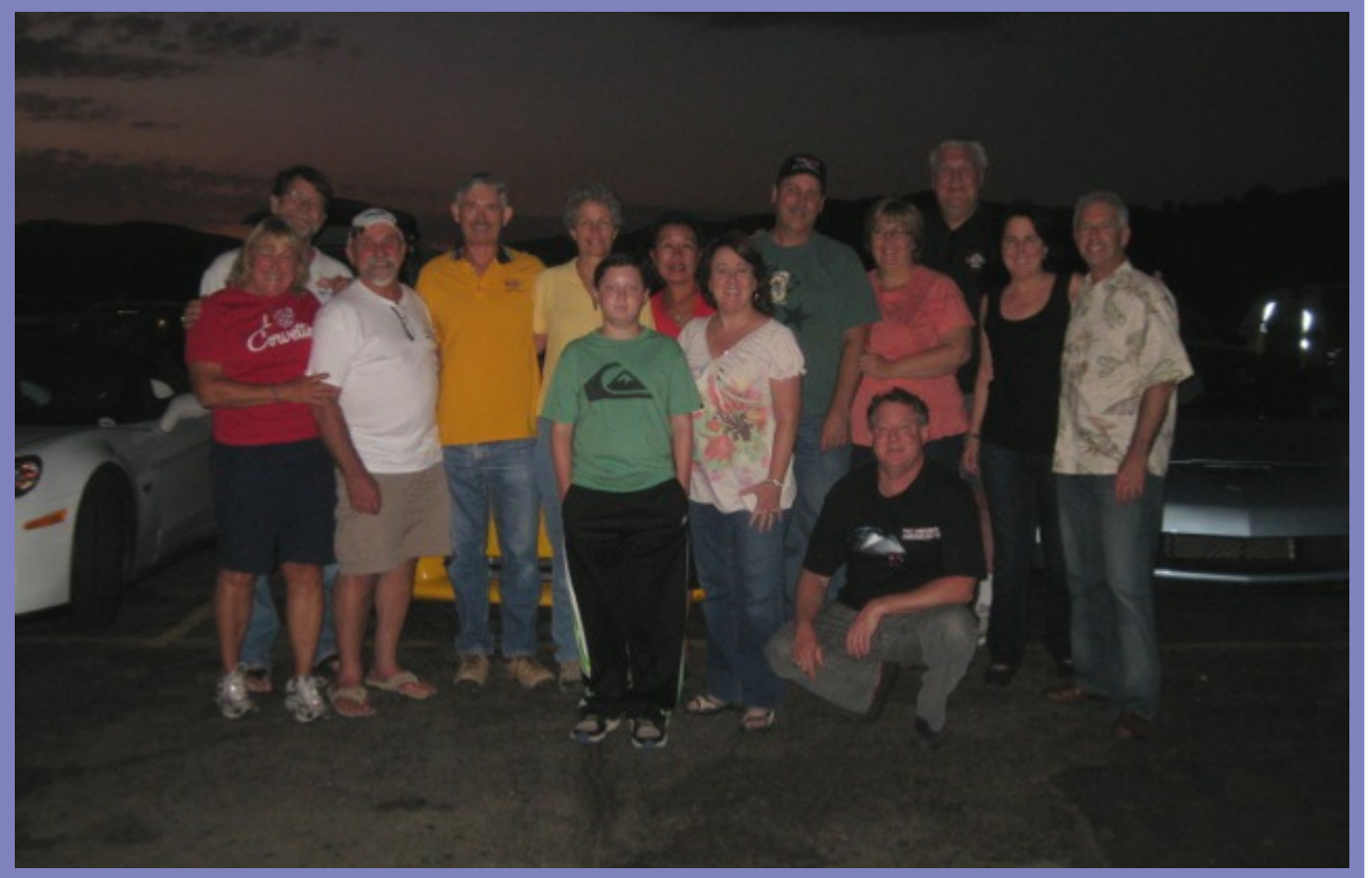
A fun summer night at the Drive-In movie!