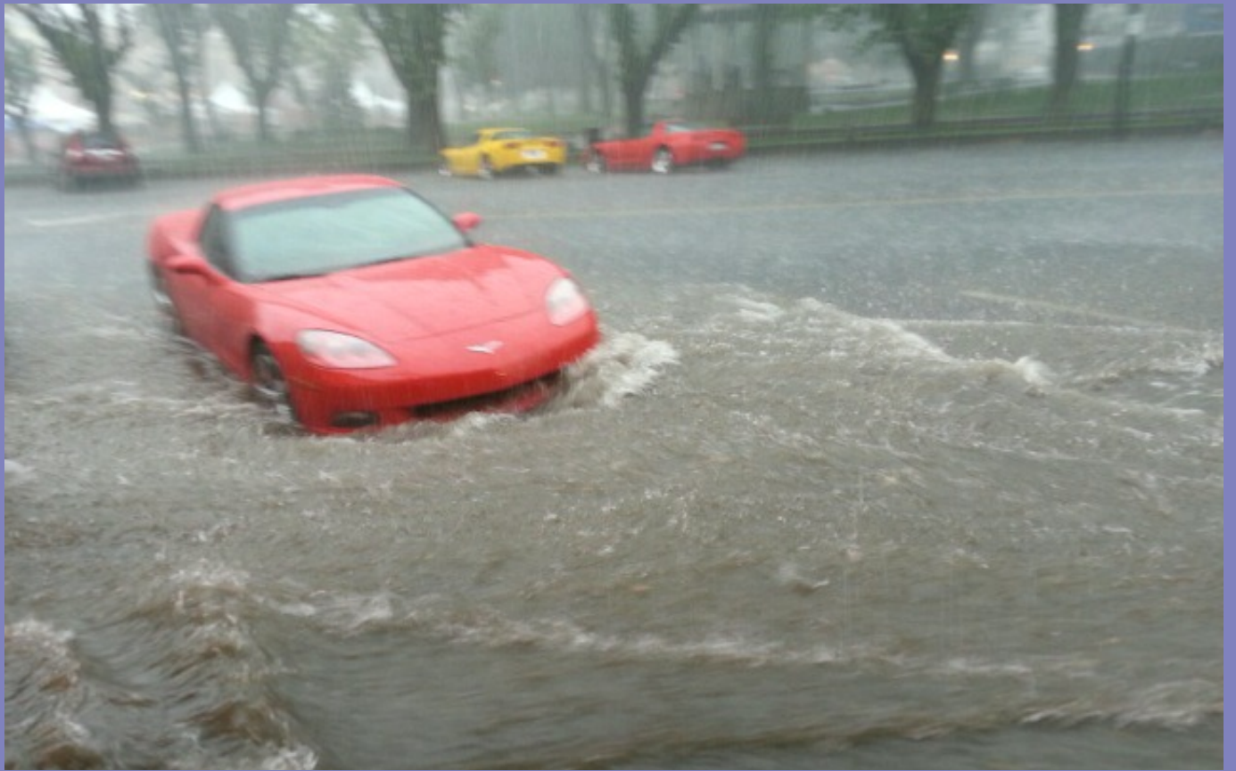
Wait, is that water? Downpour at the Prescott Corvette Show.