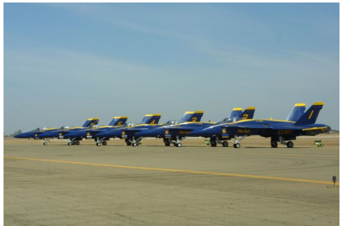
Here the star billing of the show awaits takeoff, the famous Blue Angels.