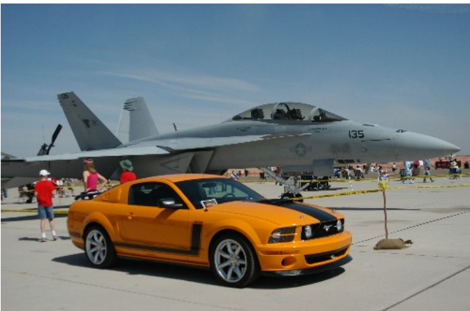
Another Mustang Saleen and the F-18.