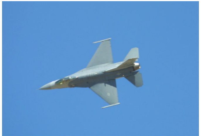
The Air Force F-16 flying Falcon, going through some tight maneuvers.