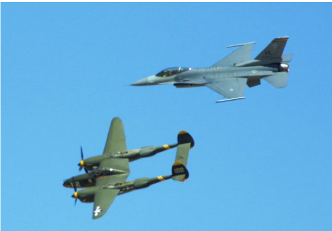
A P-38 and F-16 doing flyby's. Pretty neat stuff.