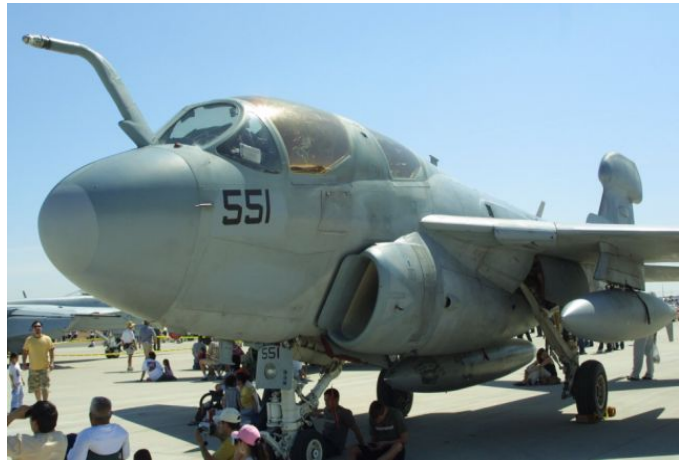
An EA6B jamming aircraft on display.