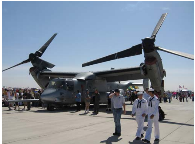
The new V-22 Osprey on display with some of the sailors from El Centro.