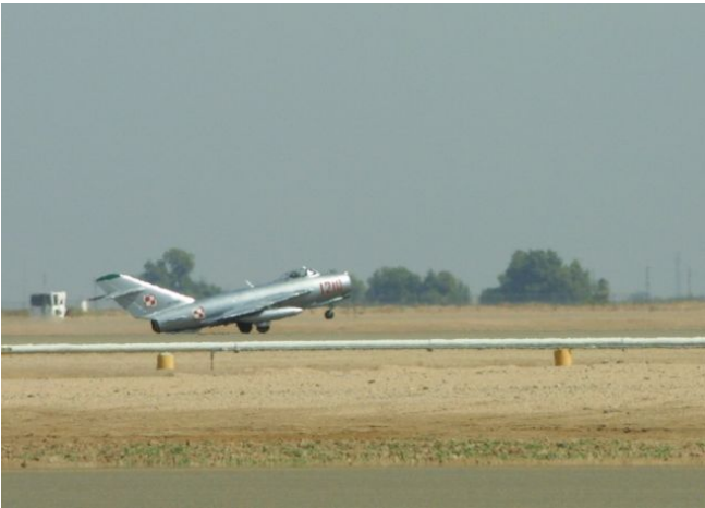
Mig 17 on takeoff for a little dogfight action.