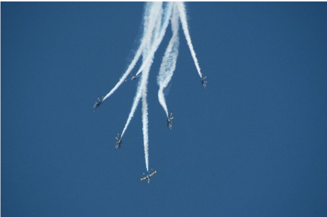
This is the “fleur de lis” breakaway.