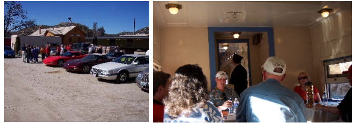
Poverty in Mexico

Campo train station. This used to be a U.S. Black Cavalry Horse Soldiers' duty station during WWI. On the right: Inside the train car