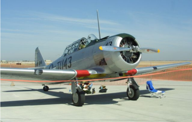
An AT6 trainer, the workhorse of the flying services.