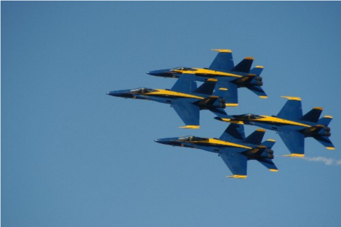
Less than 36” apart!