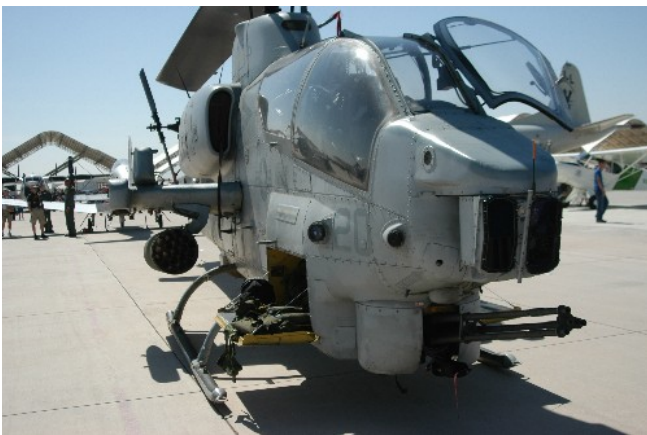
A Cobra helicopter (Thanks Bob for the background info on this aircraft and other display aircraft).