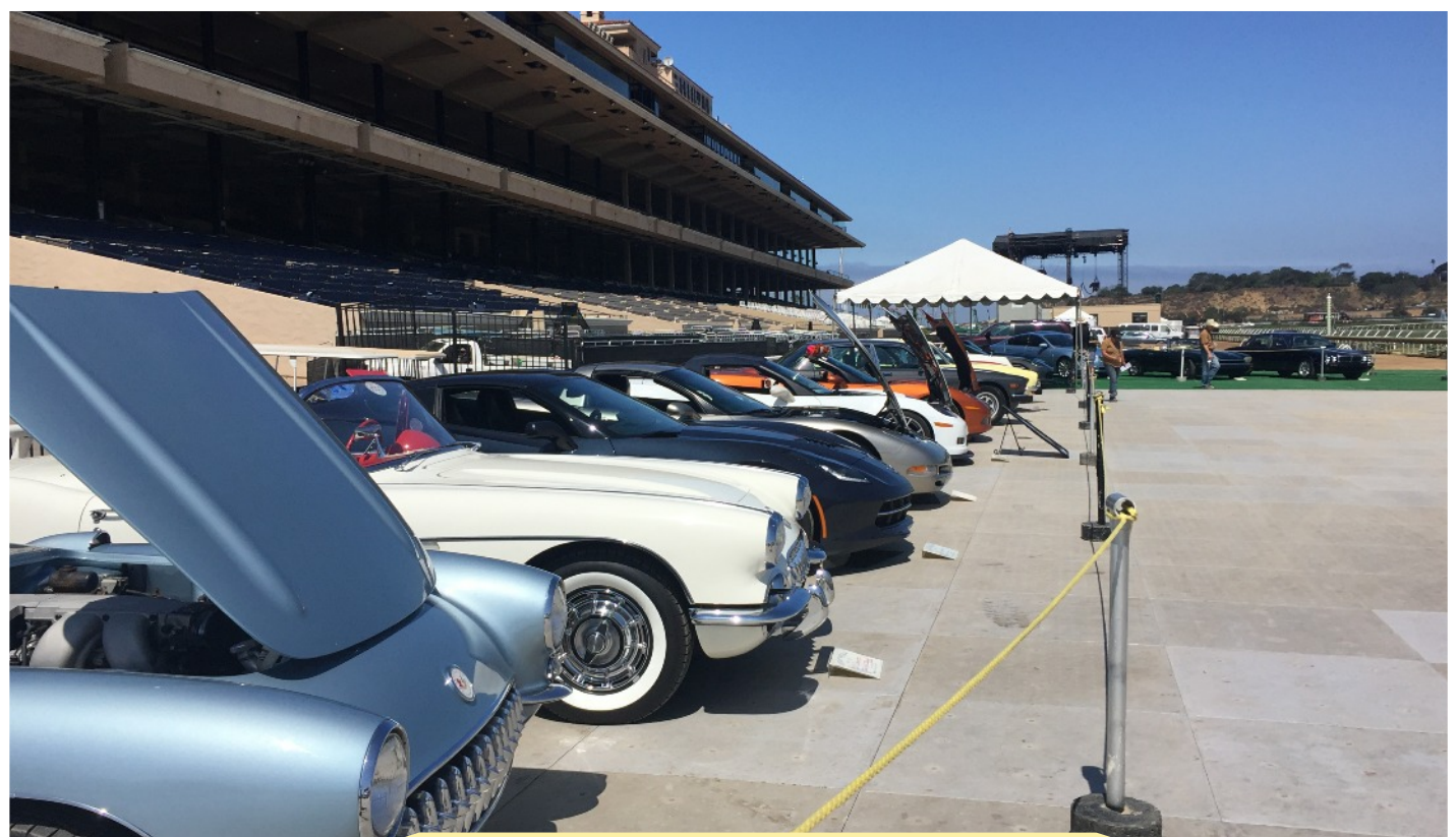
San Diego County Fair