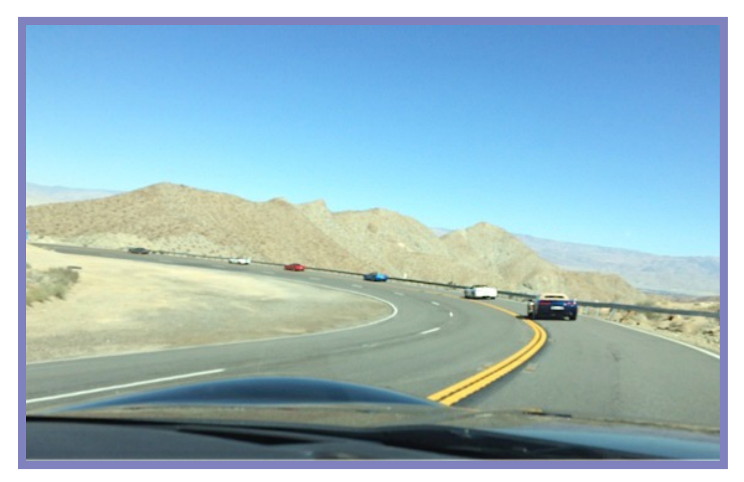
What a beautiful February day! NCoCC heads down the mountain into Rancho Mirage for a lovely Valentine lunch!