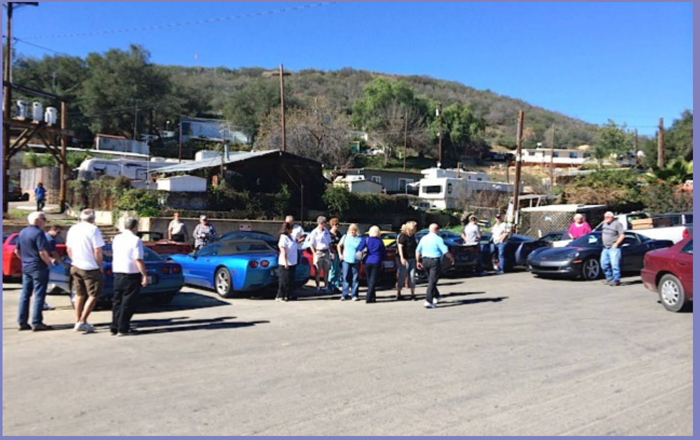
A gorgeous January day for a drive to Lake Wohlford Cafe!