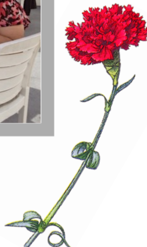
The annual kiss!