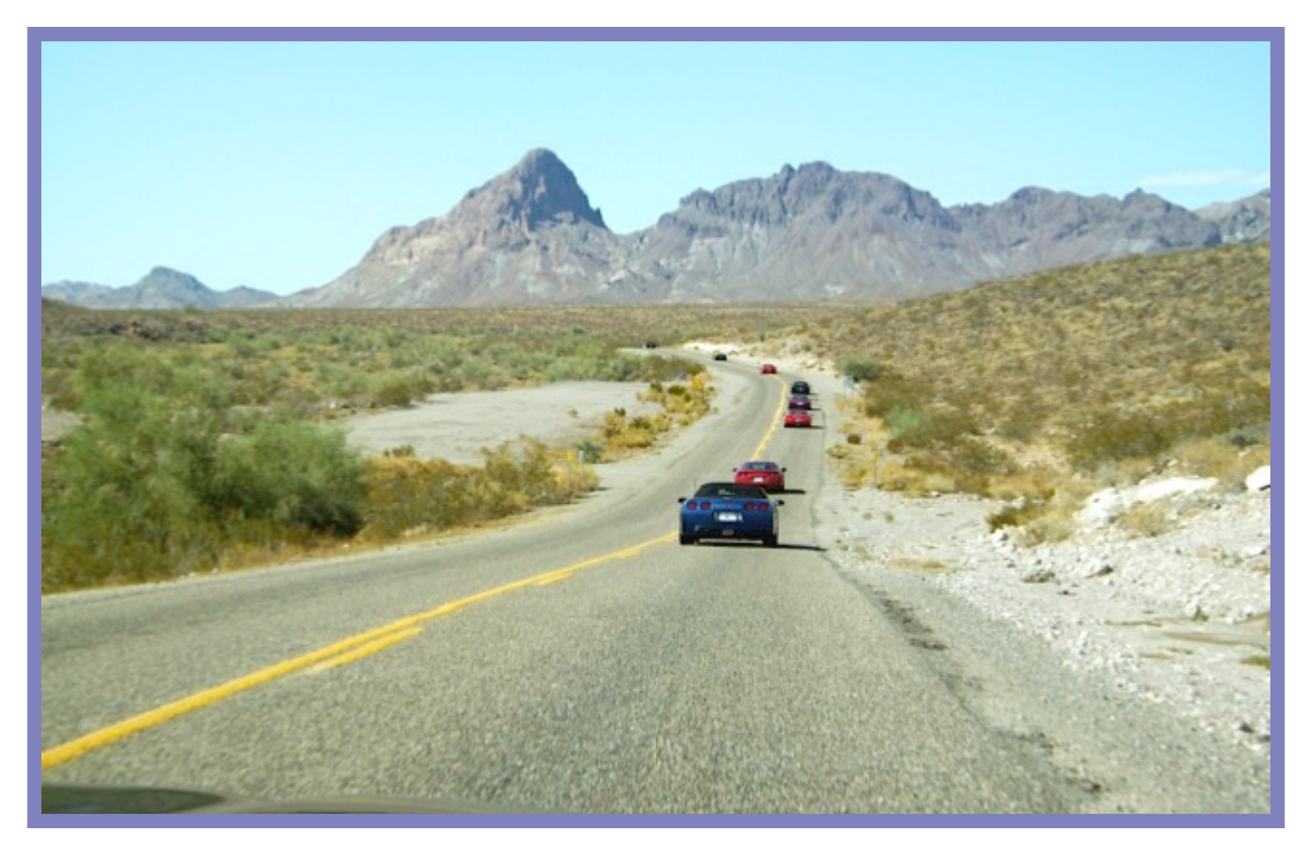
August 28-30 All roads lead to Bowling Green. 28th Anniversary National Corvette Museum