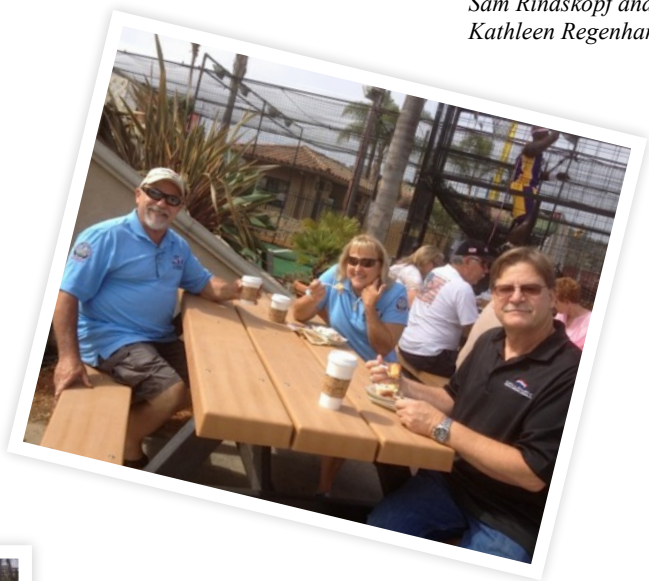
Coffee and cinnamon rolls!